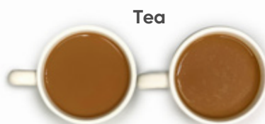
Lactorich Blis R5 Top FFMP competitor