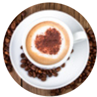
Beverages (coffee, tea, hot chocolate, cereal drink)

Delivering the perfect combination of a rich and creamy flavor with a smooth mouthfeel, ofi's instant filled milk powder, Lactorich Blis R5 , offers you an affordable solution in applications like milk-based beverages, savory soups, seasonings, sauces and drinking milk.