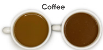
Lactorich Blis R5 Top FFMP competitor