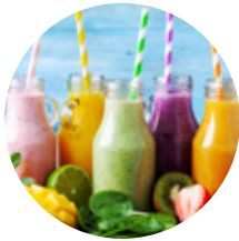
Beverages (i.e. fruit-flavored milk drink)